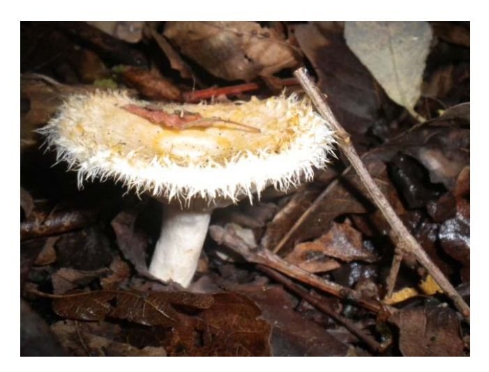
Lactarius mairei

In September 2010, Fiona Turner, who lives near Banbury, was lucky enough to find a specimen of the amazingly shaggy milk cap Lactarius mairei . She sent the photo into Gavin Bird at TVERC for confirmation with the FSO. It is an unmistakeable fungus, so easy to confirm. I just hope it turns up one day in our forays further south!