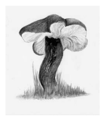
Entoloma bloxamii by Pam Hills