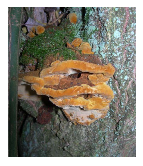
Phylloporia (Phellinus) ribis

Hinksey Heights Nature reserve, which has calcareous fen and a lot of very wet woodland, produced some small toadstools of the 'Little Brown Job' type which were however immediately distinctive by their strong 'Moth Balls' (Naphthalene) smell. These are therefore in the genus Camarophyllopsis with a common name for the genus of 'Fan Vault' from the very decurrent gills. All members of the genus are rare, Red Data Listed, but as to which species, not known yet. The black speckles on the stipe indicate C. atropuncta (Dotted