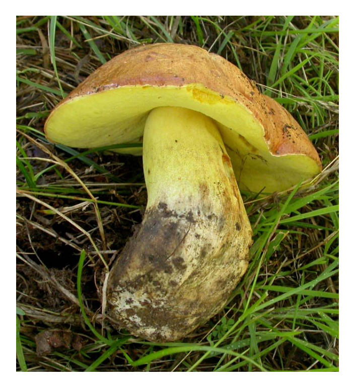
Boletus appendiculatus

So I began to wonder why so late? The easy explanation would be the weather, but why? So I went to my database to check the records, to my amazement I had only found it previously twice at this place, on 24th September 1997 and 30 August 2004 both very late records for the species showing that this location. Also within this 200 yard stretch of woodland other rare boletes are to be found including B. queletii, B. fechtneri, Xerocomus chrysonemus and Leccinum crocipodium , showing me that we have pockets in the UK that do not conform to normal sightings.